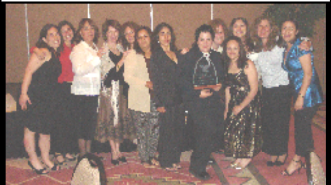
Enlacersos party it up at the MALSA awards Dinner. Enlace was honored with the Fighting for Justice Award!

On April 11, 2008, Enlace Comunitario and El Centro de Igualdad y Derechos paired up and hosted "Immigration Tips for Advocates Training." More than 120 service providers and allies from across the state took the training which covered understanding the immigration system, detention and detainment issues, documentation of abuse and working with immigrant survivors of domestic violence. Thanks to El Mezquite Grocers and Frutería del Río for their generous food donations!